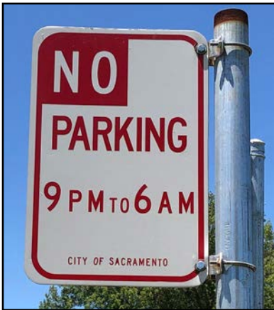
Example of requested sign.