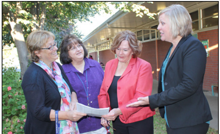
Add caption with names

I am looking forward to an exciting year of learning at Bancroft Elementary! Please feel free to contact me or come by the school for any questions, concerns, or ideas you would like to share.