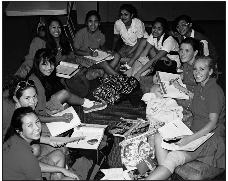
St. Francis High School students enjoy the new Demetre and Carlsen Center for Campus Life.