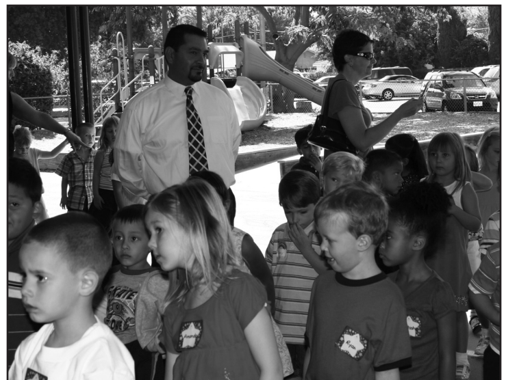
Anxious and excited, new kindergartners gather for the first day of school at Bancroft Elementary.

We're pleased to announce that Bancroft once again increased its Academic Performance Index. The API is a measure by the State of California on standardized tests that reflects how a school and its students are doing. We are proud to be at 862, and realize that the hard work and diligence needs