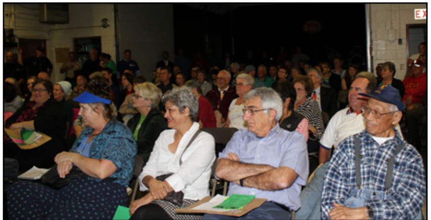
Members of the Glenbrook and College Greens neighborhoods gathered at Fire Station 60 for a report on 2015 Association activities and to hear from their community leaders .